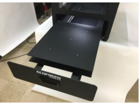
40x50cm (16"x20") Size Platen Thick hood jacket can be loaded