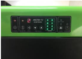
Easy Control Panel Speed(Volume) / Bi- or Uni- Directional Spray Auto Nozzle Cleaning Mode Spray Area Select