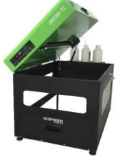
Top Cover Open for easy maintenance