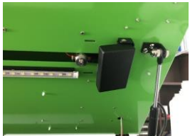
Nozzle Capping Station Automatic Nozzle Cleaning Every 3 hours and Nozzle Kept in Capping Station After Turning off to Prevent Nozzle Clogged