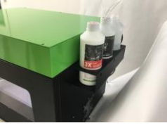
1 liter liquid bottle holder Easy to Switch Pretreatment Liquids